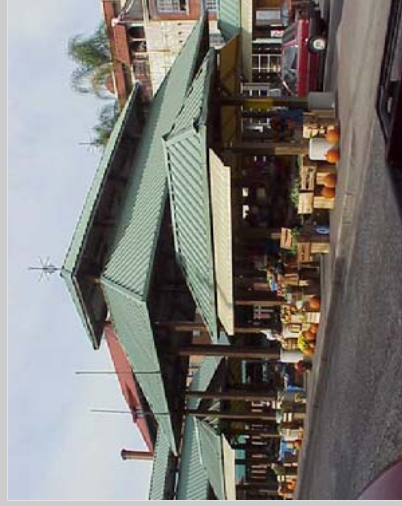
17th St. Farmers' Market, 100 North 17th St.